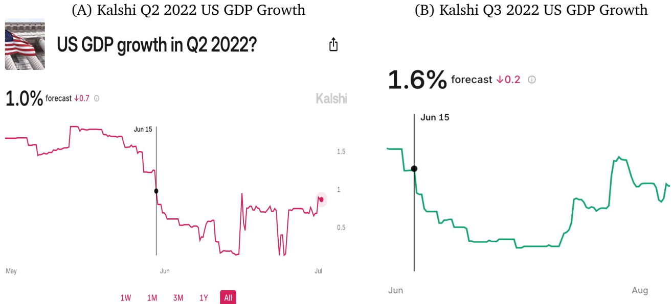
Figure 1. Kalshi GDP Contract Prices around June 15, 2022

some smaller-scale, unlicensed predecessors like Intrade and PredictIt, Kalshi has a license from the U.S. Commodities Futures Trading Commission, allows participants to take much larger positions of up to $7 million, and has affiliated companies that act as liquidity-providing market makers, all of which enhance market functioning and should improve the accuracy of contract prices for predicting future events. We focus in particular on the most heavily-traded macroeconomic event contracts on the Kalshi exchange: contracts covering the Federal Reserve’s federal funds rate announcements and the U.S. CPI, GDP, and unemployment rate releases.